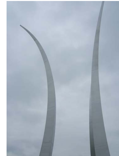
United States Air Force Memorial