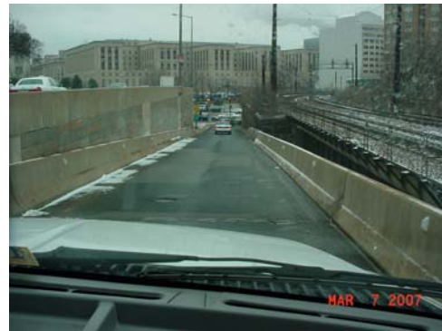
Ramp from I-395 to Maine Ave.