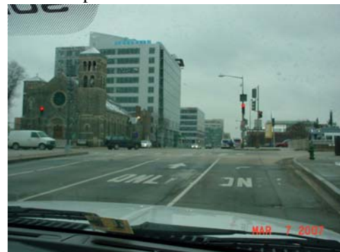
Road conditions in DC.