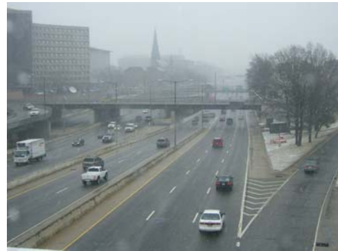
I-395 from L'Enfant Promenade.