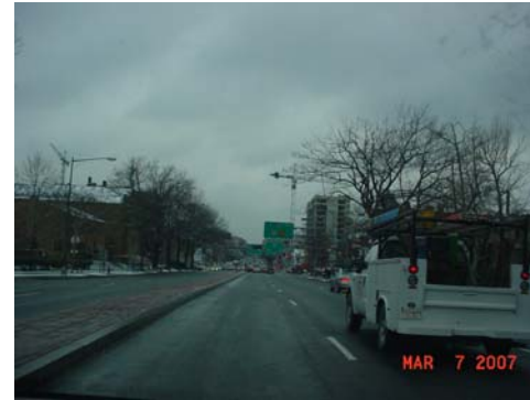
In the study area in DC.