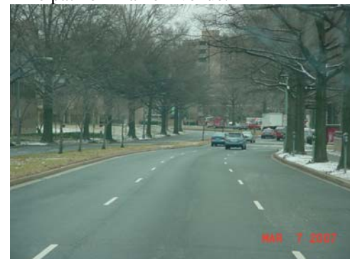
Roads in SW neighborhood.