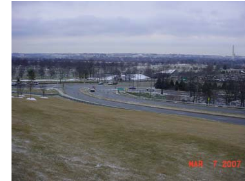
Study area from USAF Memorial.