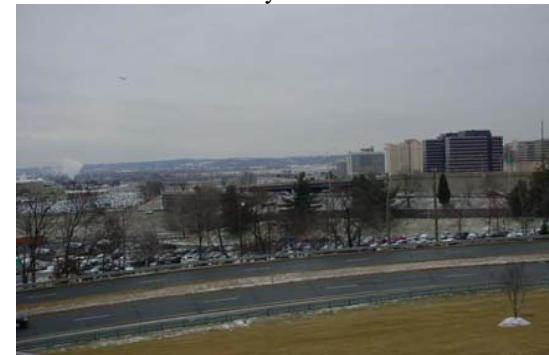
View of Arlington study area.