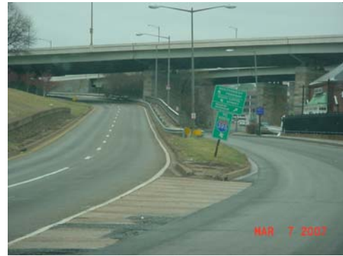
Exit for I-395 from Maine Ave.