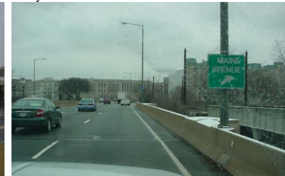
Maine Ave exit from NB I-395.