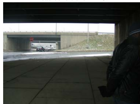
Intersection of Eads Street to the Pentagon and on/off ramps to NB I-395.