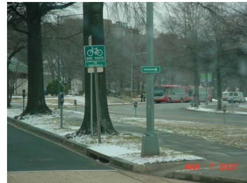
Bike path on Maine Avenue.