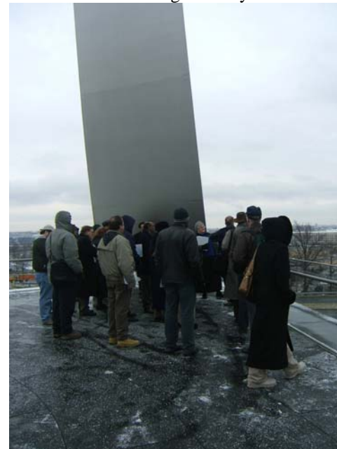
Field View stop at the USAF Memorial